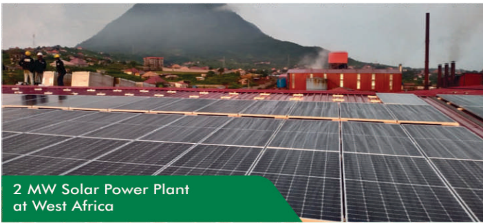
2 MW Solar Power Plant at West Africa