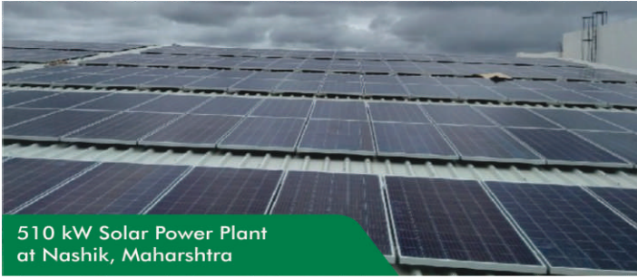
510 kW Solar Power Plant at Nashik, Maharashtra