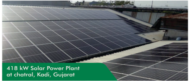
418 kW Solar Power Plant at chatral, Kadi, Gujarat