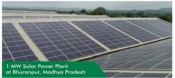
1 MW Solar Power Plant at Bhuranpur, Madhya Pradesh