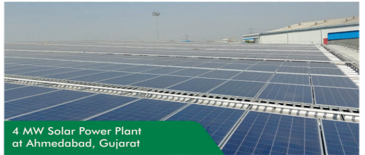
4 MW Solar Power Plant at Ahmedabad, Gujarat