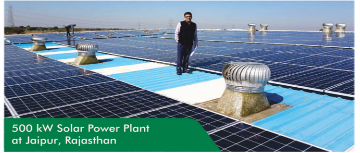
500 kW Solar Power Plant at Jaipur, Rajasthan