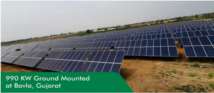
990 KW Ground Mounted at Bavla, Gujarat