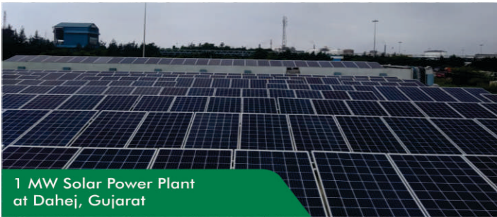
1 MW Solar Power Plant at Dahej, Gujarat